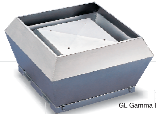
GL Gamma BFC

For full specifications and technical data visit www.fantech.com.au or contact your nearest Fantech distributor.