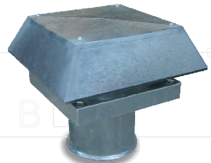
New Generation BFC